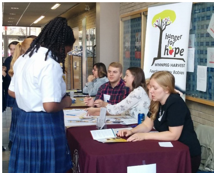
>Service Fair, fall 2022

CHARISM IS A DISTINCT SPIRIT THAT ANIMATES A RELIGIOUS CONGREGATION. IT'S A CALL TO MANIFEST THE GOSPEL IN A UNIQUE WAY. ST. MARY'S CHARISM FLOWS FROM THE GIFTS GOD GAVE TO BLESSED MARIE-ROSE DUROCHER, THE FOUNDESS OF THE SISTERS OF THE HOLY NAMES OF JESUS AND MARY. THE CHARISM IS ROOTED IN THE PRIMACY OF GOD'S LOVE AND THE POWER OF EDUCATION TO DEVELOP THE POTENTIAL GOD GAVE EACH OF US.