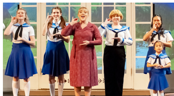
The Sound of Music, fall 2019