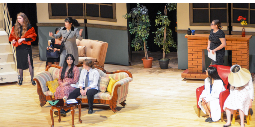
Grade 10 Performance Exam, spring 2022

St. Mary's Academy's Drama Program is offered to students in grades 7, 9, 10, 11 and 12. Each grade level focuses on different aspects of theatre, from auditioning to acting, from costume design to building sets & props, learning about theatre technology and studying a range of styles and genres. Skills are learned through individual and group exploration of diverse topics, units, genres and styles and are often enhanced by local industry professionals as guest speakers. Our program ranges from learning cooperative social skills and public speaking in grade 7 to the mounting of a full scale, student-led production in grade 12. Participation in a leadership capacity (onstage or off) in the biannual schoolwide drama production is expected in senior level drama students.