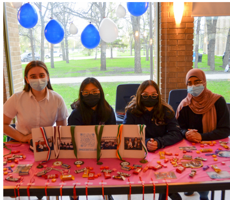
Debate Club during SMA Welcome event, spring 2022

> British Parliamentary National Debate Tournament at Selwyn House School, Montréal, PQ